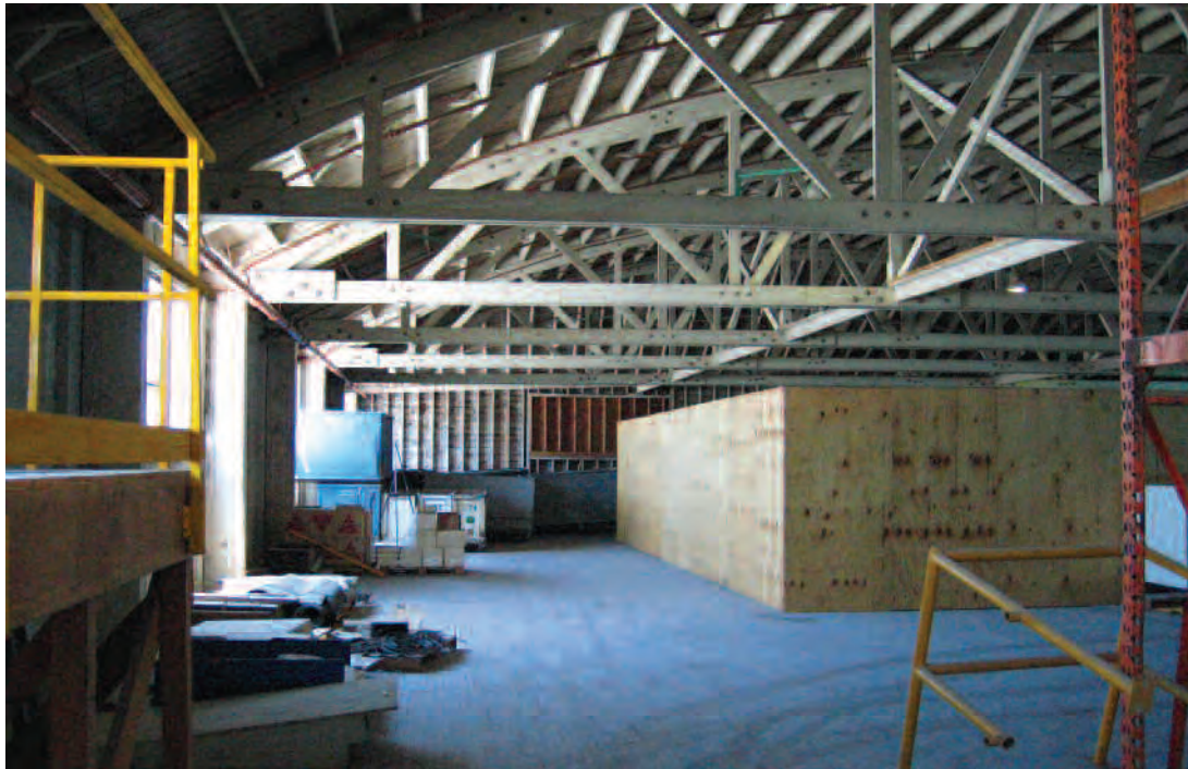
The Old Mill Building, built in the late 1880s and featuring the dramatic wood-truss ceiling shown here, is an excellent candidate for adaptive use.

ing decks placed atop the existing structure. Units also could be located along Commercial Street and serve as live/work entrepreneur units.