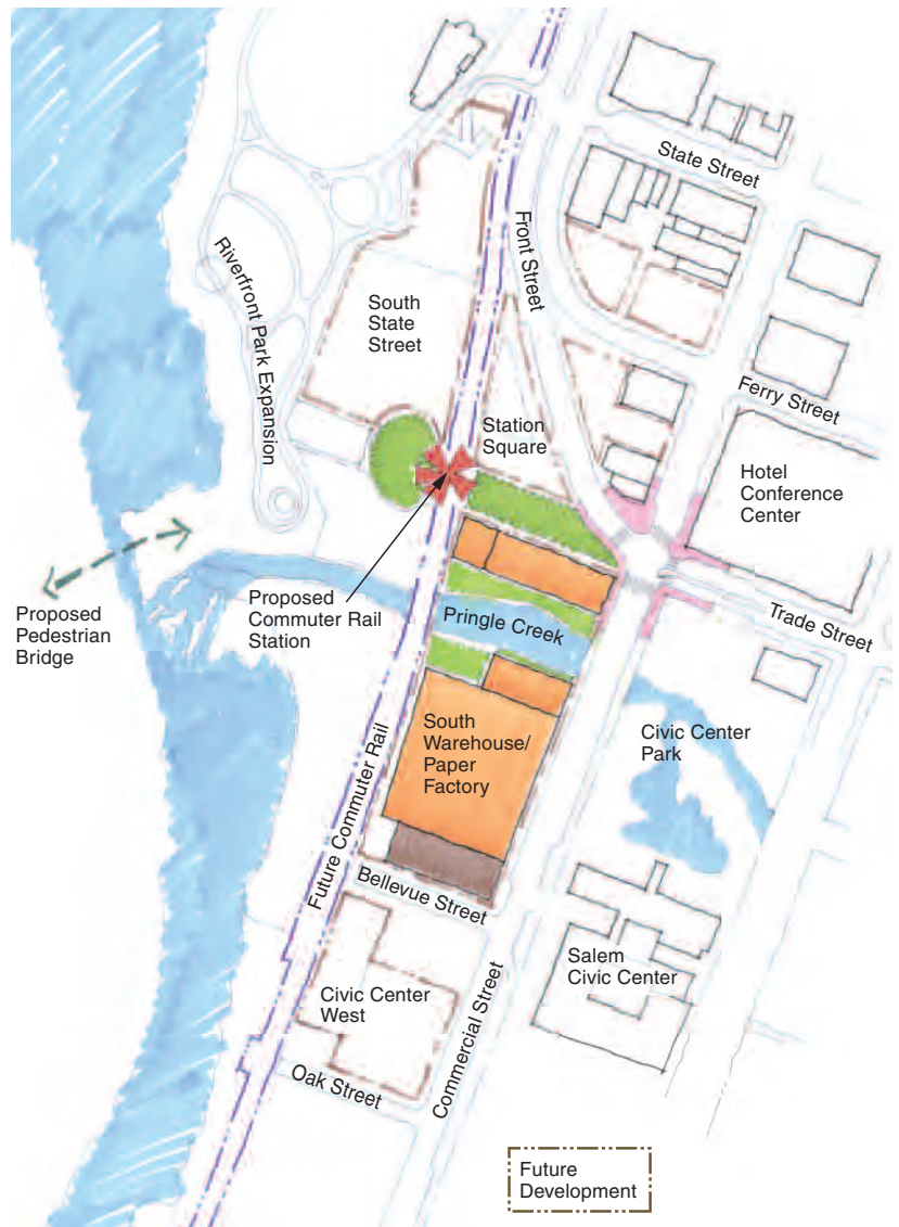
Site plan of the study area.

Adjacent to this building on the south is a vacant property currently used for truck loading access