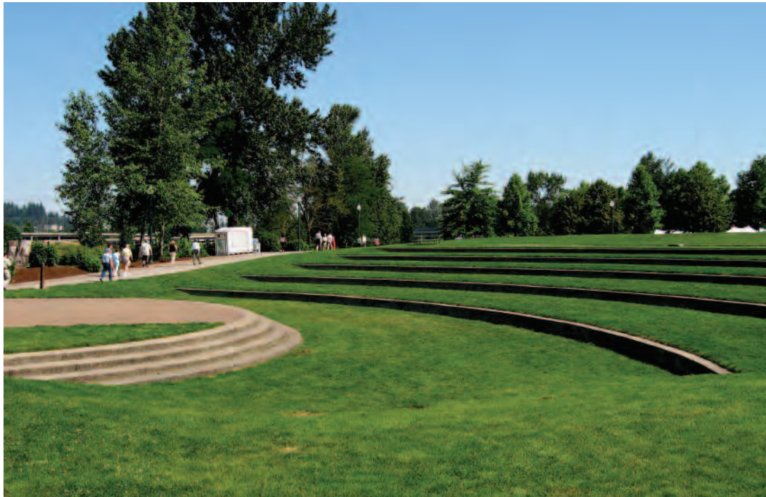
The success of Riverfront Park demonstrates the community's hunger for increased access to the Willamette River and other natural environments.

have an important effect on parcel configuration, waterfront configuration, and safety.