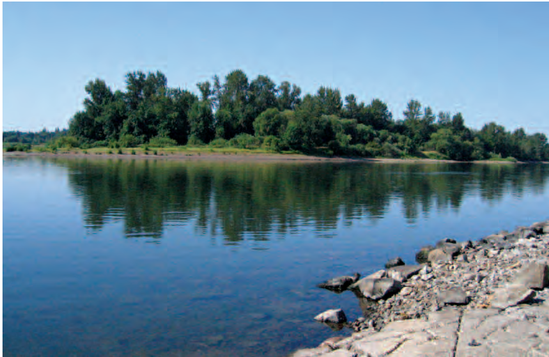
The 310-acre Minto Island parcel is undeveloped and prone to flooding.