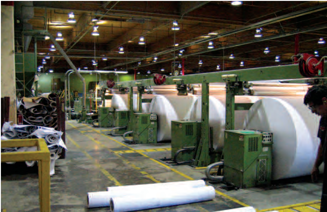
The site presently houses packaging and distribution operations for Boise Cascade. Giant rolls of paper manufactured elsewhere are converted into packaged products ready for sale.

parcels in order to create additional value for both Boise and the city.