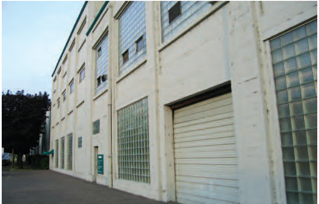
Redevelopment proposal for existing Boise Cascade buildings.

The South Warehouse represents a significant asset due to its potential for conversion to provide parking. The panel suggests that the parking be surrounded by new residential lofts.