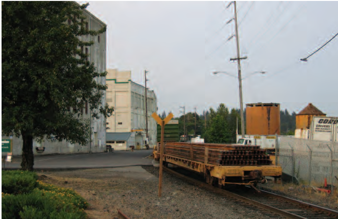
The downtown Boise Cascade site is bisected along a north-south axis by the Portland & Western railroad tracks.

structures—are hidden and not celebrated as they should be. Environmental and historic matters need to be resolved before the buildings and land can be reused, and the location of the Minto Island property in the floodway results in frequent flooding and prevents development of structures there.