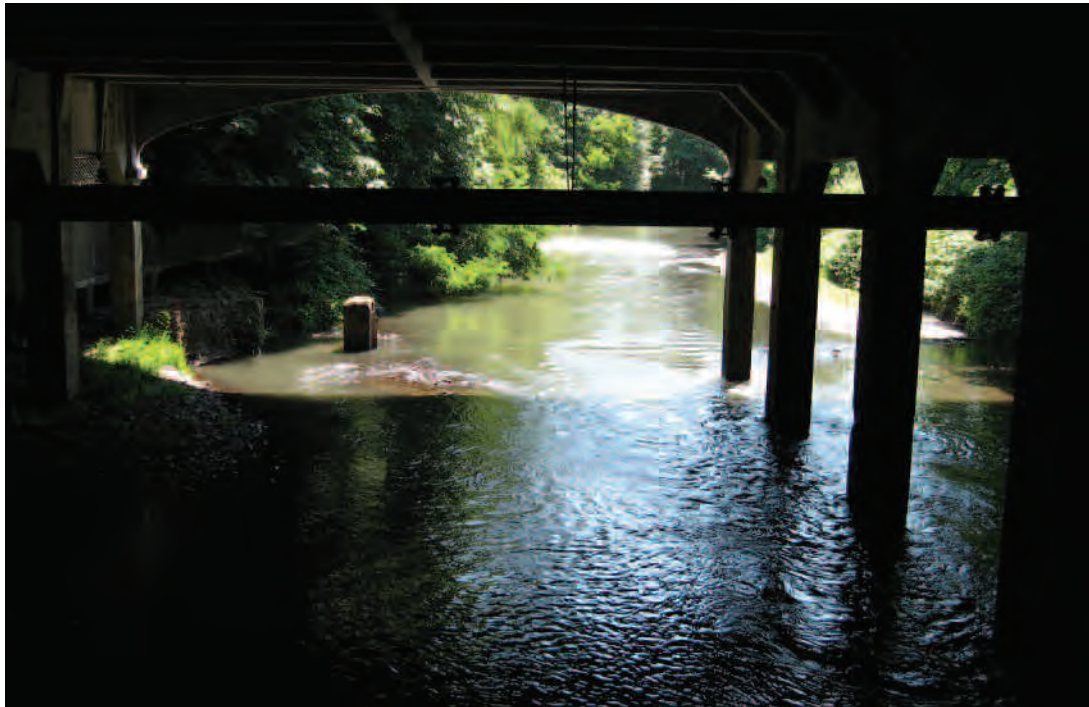
Pringle Creek flows under the center of the existing building complex. The panel believes that any redevelopment scenario should open the creek for public access and create a view corridor from Civic Center Park and Commercial Street.

offices, spectacular residential lofts, or, as market conditions allow, a boutique hotel with a restaurant.